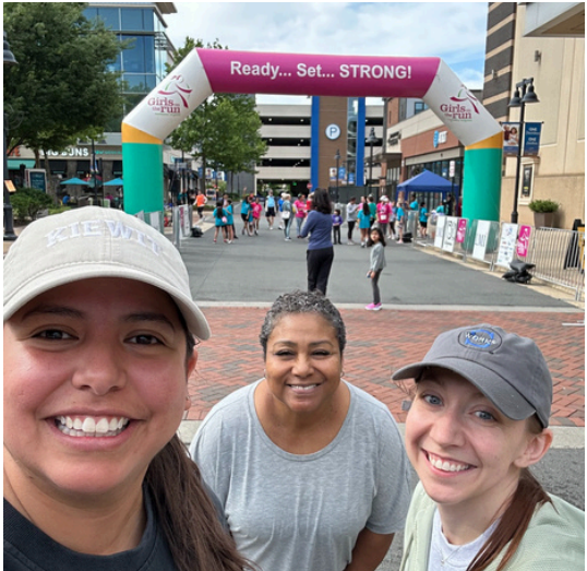
GOTR 5K - MAY 16 TH , 2025

HAVE YOU VISITED OUR WEBSITE? FIND MORE INFORMATION ON NAWICNOVA.ORG